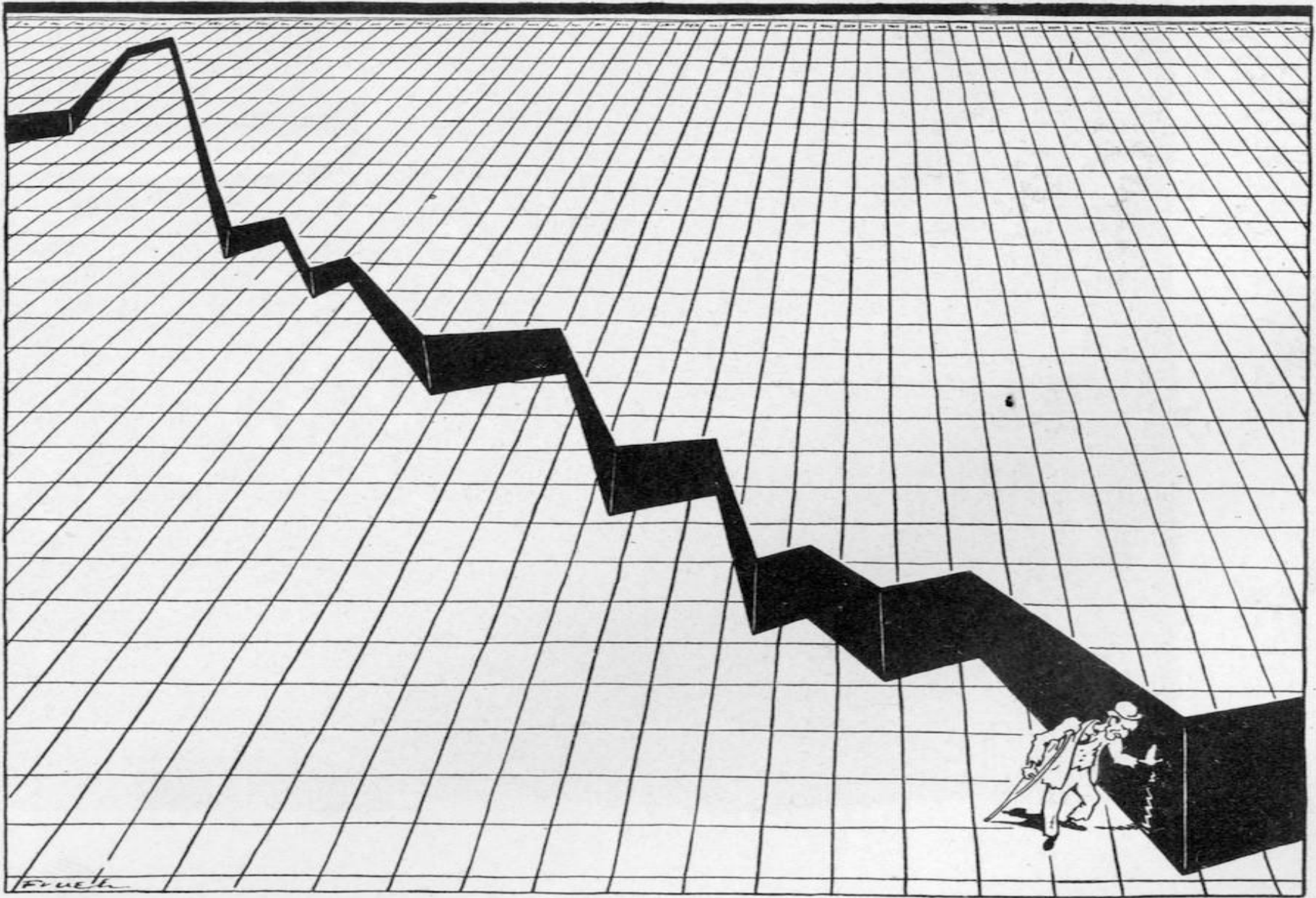
Just around the corner