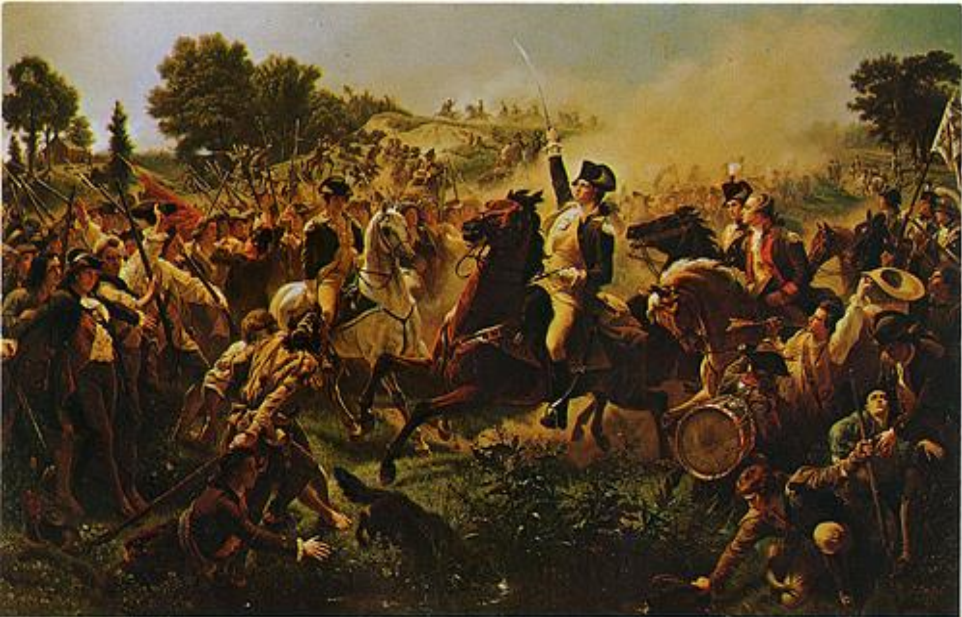
Washington at Monmouth