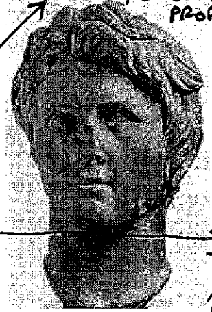
Stone portrait. Alexander the Great. Dresden, Albertinum.

Jews throughout the centuries have been using the name Alexander. This has been in accordance with their high priest's decision that "Alexander's name should remain in eternity." The decision was taken because, when Alexander visited Jerusalem, he exhibited respect towards the high priest and for the Jewish religious worship. It is said that when the Jews of Jerusalem offered Alexander gold and silver, he refused to accept them; the Jewish high priest told Alexander: "We serve only one God who created Heaven and Earth and all visible and invisible things that no human being is able to explain." To this Alexander replied, "As worthy worshippers of the true God, be in peace, for your God is my God and my peace is your peace. I shall not treat you any different from the other nations, since you serve the living God." → SOUNDS LIKE GANDHI "WE ARE ALL CHILDREN OF GOD."