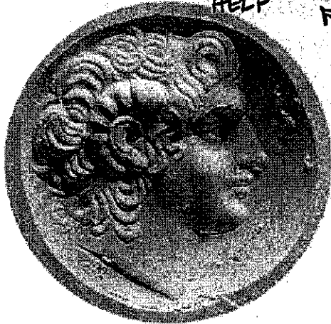
Engraved gem-stone: tourmaline. Head of Alexander the Great. Oxford, Ashmolean Museum.